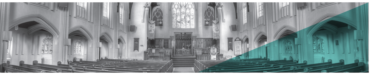
Kingston Road United Church.

25. Suicide Prevention: Assessing the value of life is a difficult topic socially, let alone in financial terms.<sup>35</sup> It is commonly assumed that the two key costs of suicide and attempted suicide are lost income and cost of health care. This assumption excludes the notion of attributing a value to the grief of family and friends. The Canadian Mental Health Association reports that the cost of suicidal death ranges from $433,000 to $4,131,000 per individual depending on potential years of lost life, income level, and economic impact on survivors. The estimated cost of attempted suicide ranges from $33,000 to $308,000 per individual depending on the level of hospital costs, rehabilitation, family disruption