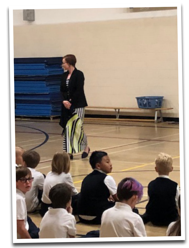
The principal leads a regular assembly that includes parents

"Value even the smallest amount of involvement parents can provide."