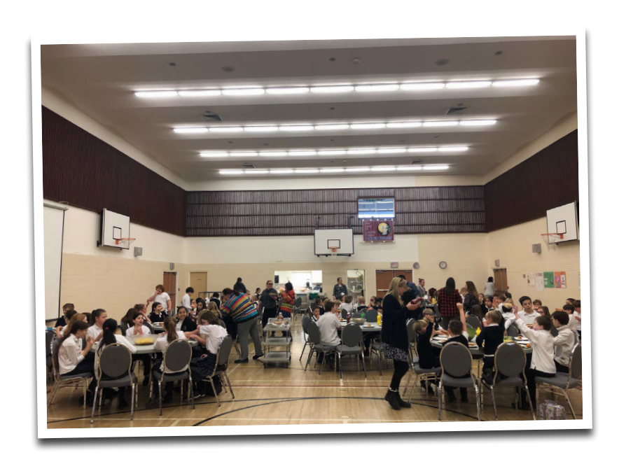
Parents help at lunchtime

In addition to providing financial support, parents at Our Lady of Lourdes share their skills with the school in a myriad of ways—some directly related to education and others to the general operation of the school. One parent, for example, "helps prepare all of the marketing