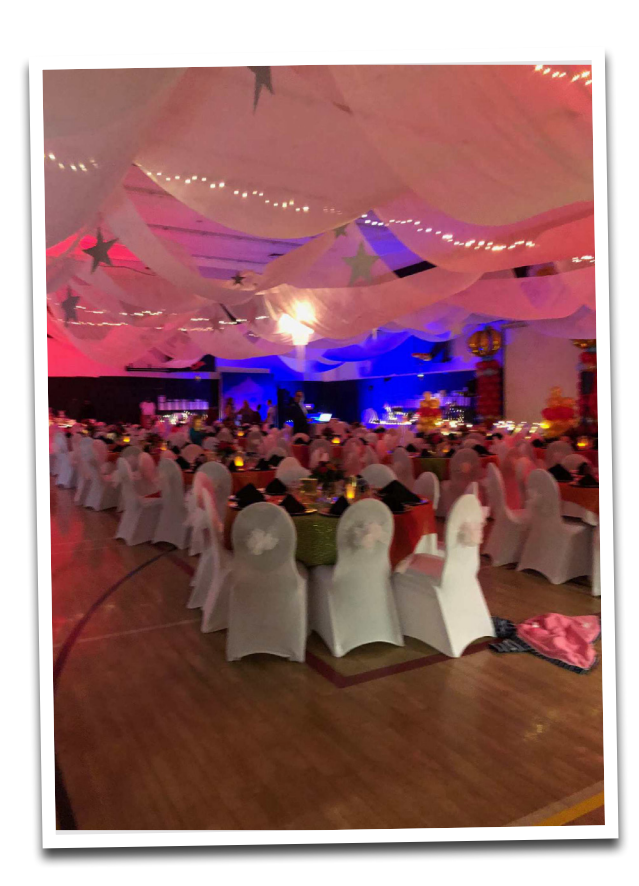
Parents help with a fundraising gala

"Each year with the registration form we send home a list of areas that people can volunteer in, and it also asks for other skills and talents. This way, we can reach out and ask parents to help with certain events or areas that we need help in. We are also a small community,