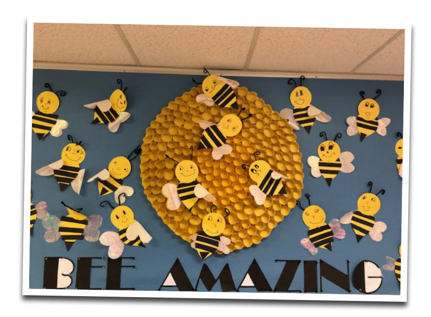
An encouraging message